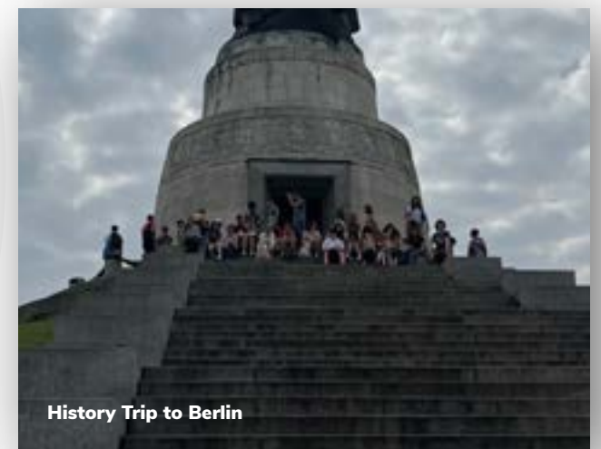
History Trip to Berlin

6 GCSEs (Grades 9-5) including Mathematics Grade 6 in GCSE History and English